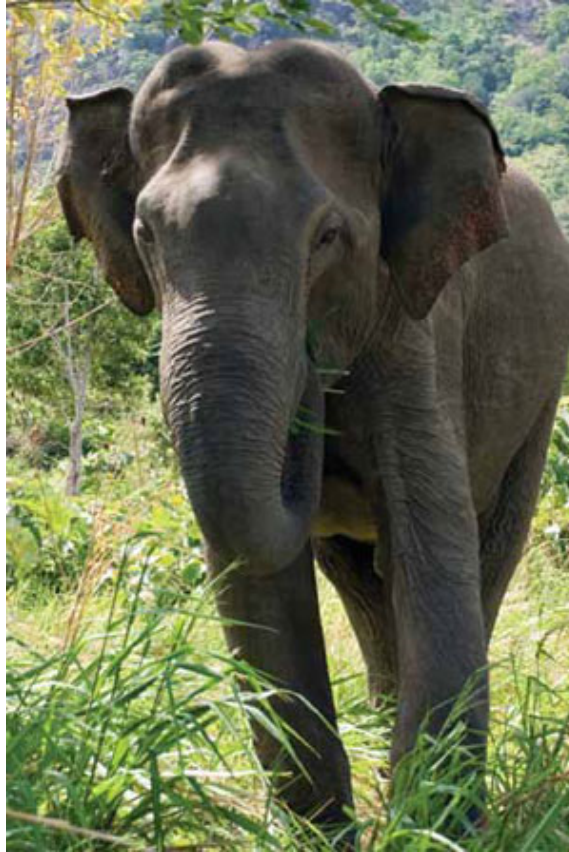
Sri Lankan scientists are collaborating with the National Elephant Herpesvirus Laboratory to shed light on the impact EEHVs are having on Asian elephants in the wild.